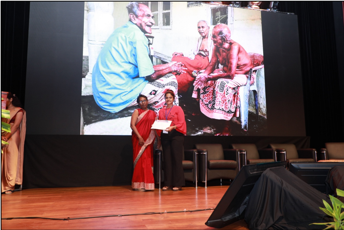
CAPAGE Photography Competition | Winners