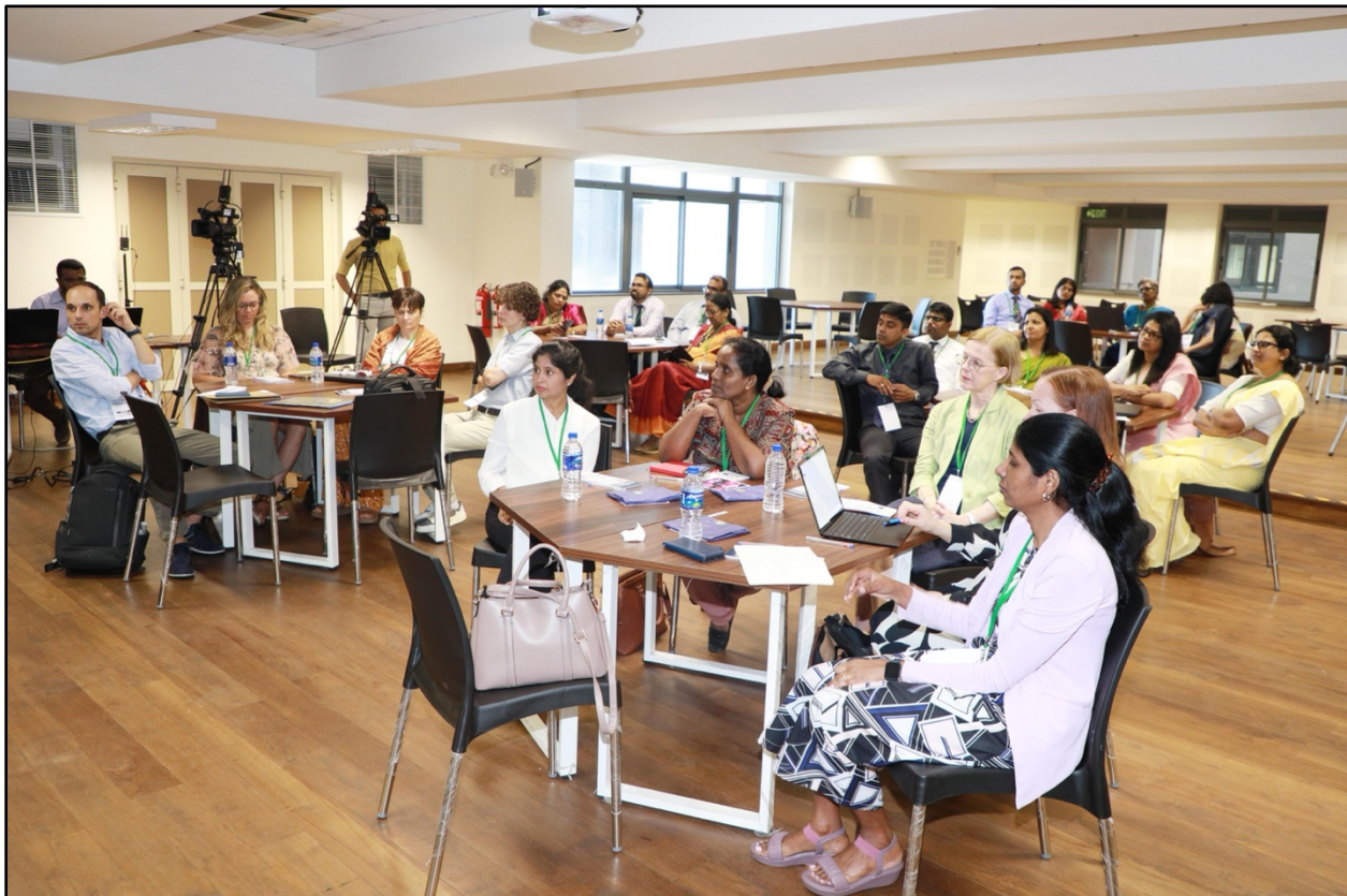
WP leaders presenting the updates and future plans