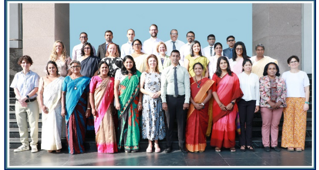
CAPAGE project members at the Faculty of Medicine, University of Colombo, Sri Lanka

The meeting commenced at 9:30 AM at the Multi-Purpose Hall, UCFM Tower, with an in-depth discussion on optimization within the CAPAGE consortium. This session focused on enhancing collaboration, streamlining project activities, and ensuring effective resource utilization across partner institutions.