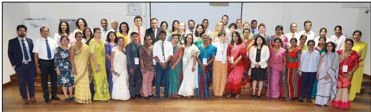
Participants of the Policy Dialogue